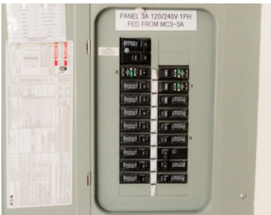
Circuit Box (University Houses)