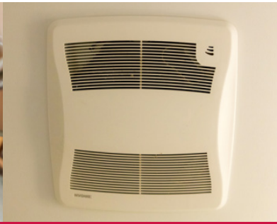
Bathroom Exhaust Fan