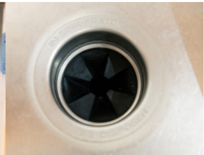
Drain Opening at Bottom of Sink