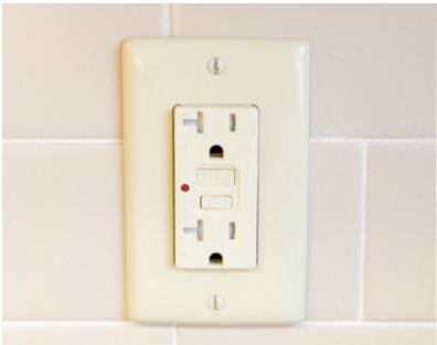
GFCI Outlet (Kitchens & Bathrooms)