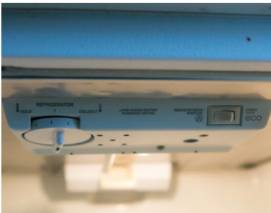
Refrigerator Temperature Controls