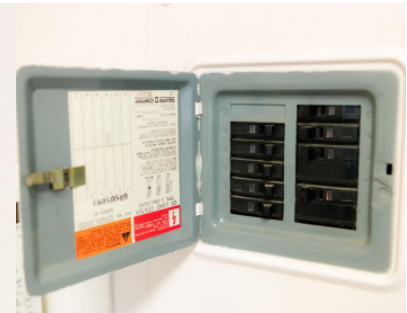
Circuit Box (Eagle Heights)