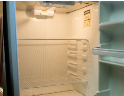
Inside of Refrigerator