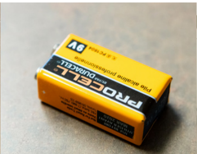
9V Battery for use in Smoke Detectors