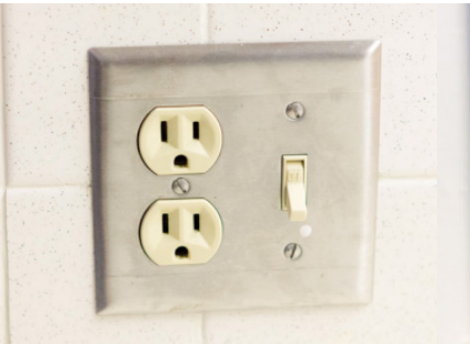
Outlet with Switch