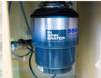
Food Waste Disposal