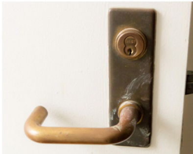
Door Lock 1