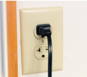
Outlet with Plug