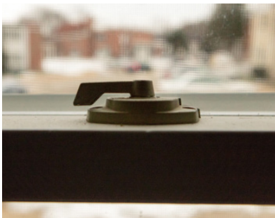
Window Lock 1