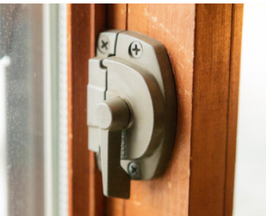
Window Lock 2