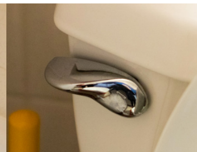
Toilet Flush Handle