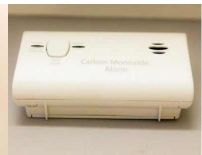
Carbon Monoxide Detector