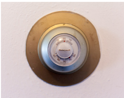
Thermostat (Eagle Heights & Harvey Street)