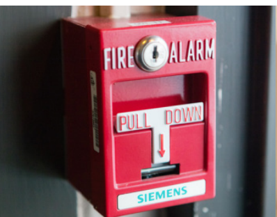
Fire Alarm Pull Station