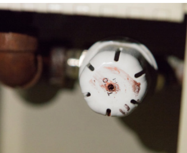
Heat Valve (University Houses)