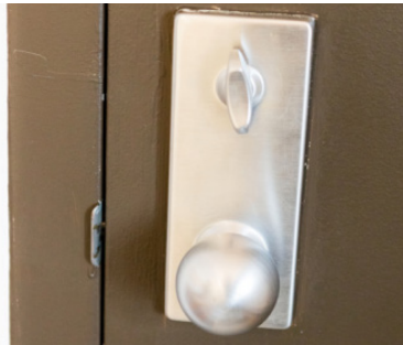
Door Lock 2