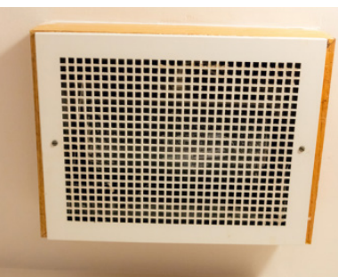
Kitchen Exhaust Vent